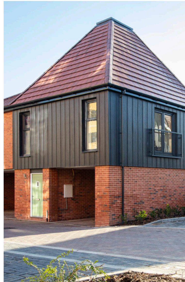
Oast House, Ashmere