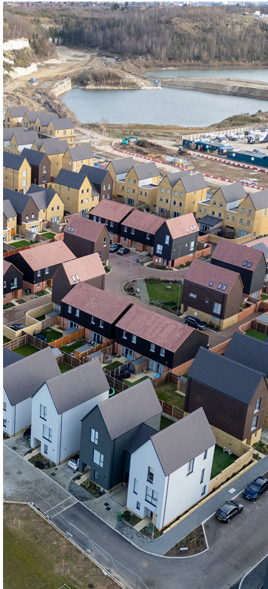
Ashmere village, PRP Architects