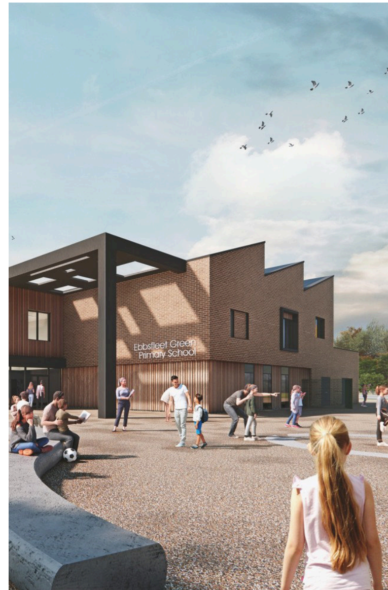
Ebbsfleet Green Primary School © gdm architects

www.designcouncil.org.uk/fileadmin/uploads/dc/Documents/Design%2520Review_Principles%2520and%2520Practice_May2019.pdf