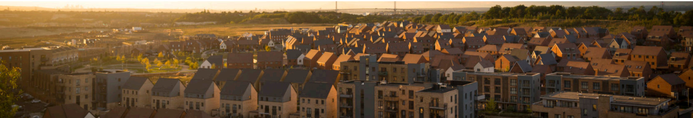
Aerial view of Ebbsfleet Garden City

Design Review: Principles and Practice Design Council CABE / Landscape Institute / RTPi / RIBA (2013)