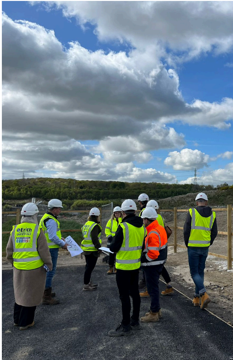
Ebbsfleet Design Forum site visit