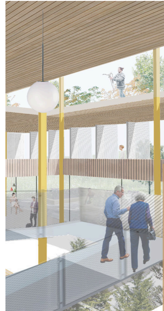
Health and Wellbeing Hub © Sarah Wigglesworth Architects

Large projects, for example schemes with several development plots, may be split into smaller elements, to ensure that each component receives officers on the policy context, and issues arising from pre-application discussions.