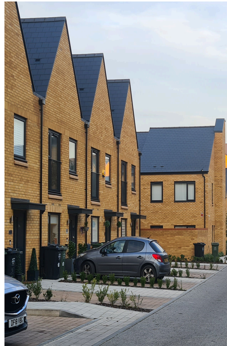
Ebbsfleet Cross

From time to time, it may be of benefit for specialist advice to be provided beyond the Design Forum membership. In such cases, a professional with the relevant expertise may be invited to attend a forum meeting, participating in the discussion with the status of an adviser to the forum.