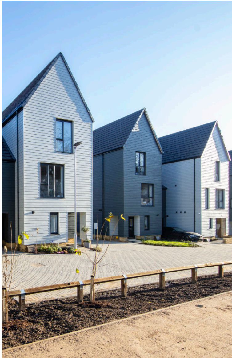
Ashmere, PRP Architects