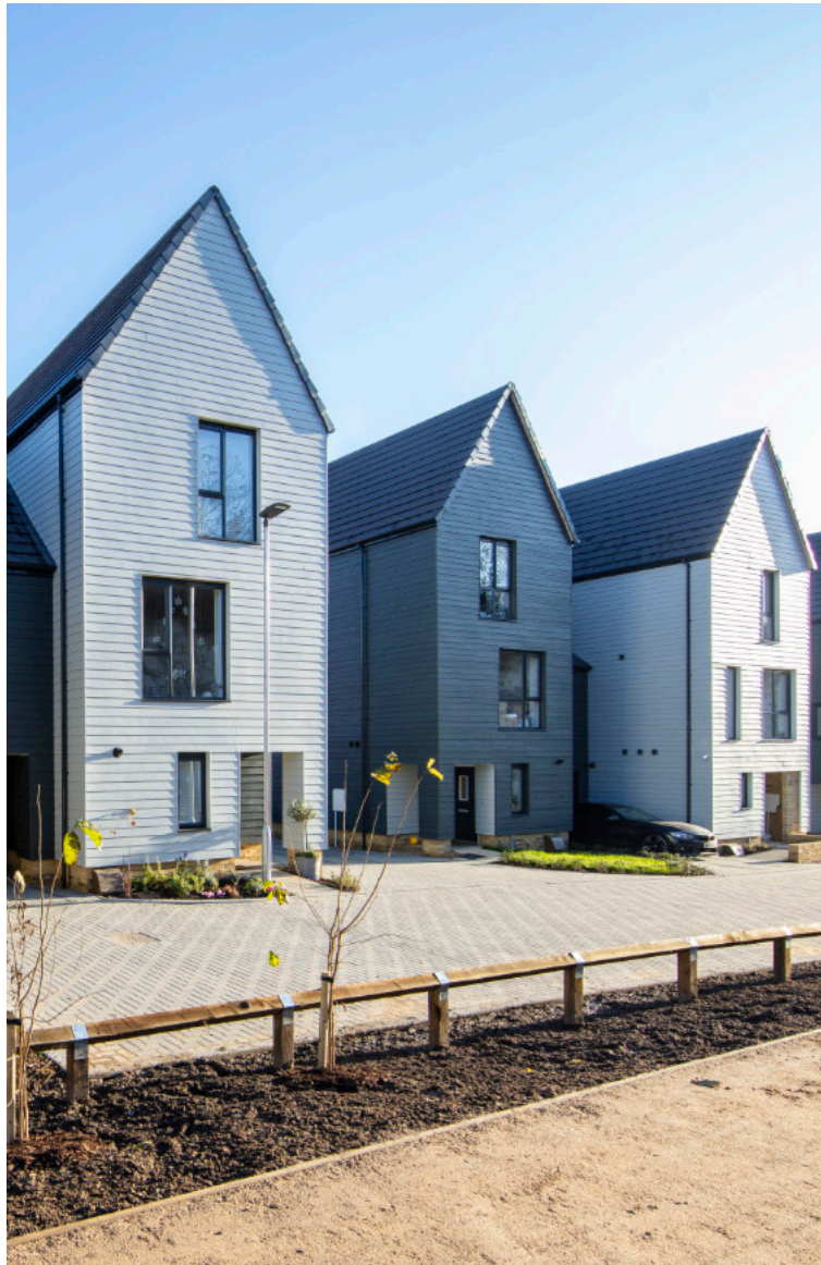
Ashmere