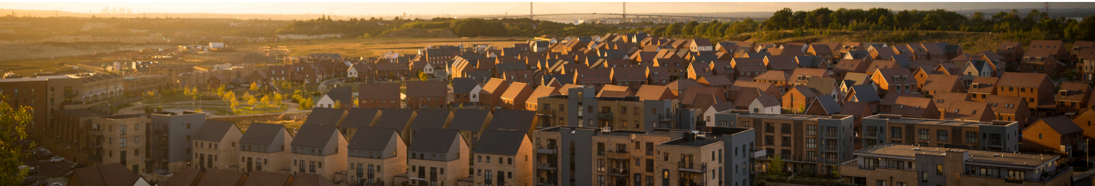
Aerial view of Ebbsfleet Garden City

Design Review: Principles and Practice Design Council CABE / Landscape Institute / RTP / RIBA (2013)