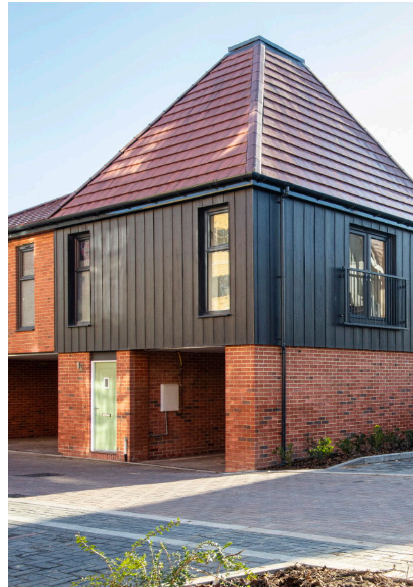
Oast House, Ashmere