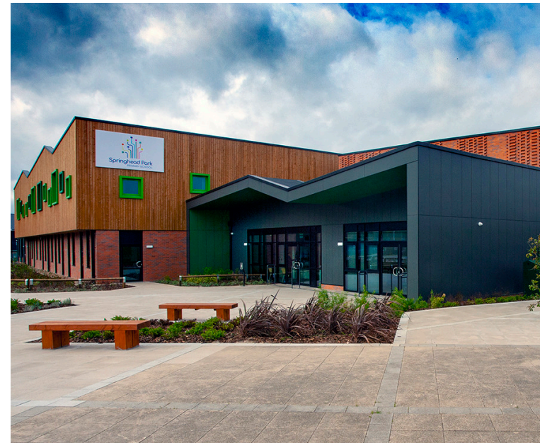
Springhead Primary School

As a public authority, the Ebbsfleet Development Corporation is subject to the Freedom of Information Act 2000 (the Act). All requests made to Ebbsfleet Development Corporation for information with regard to the Design Forum will be handled according to the provisions of the Act. Legal advice may be required on a case by case basis to establish whether any exemptions apply under the Act.