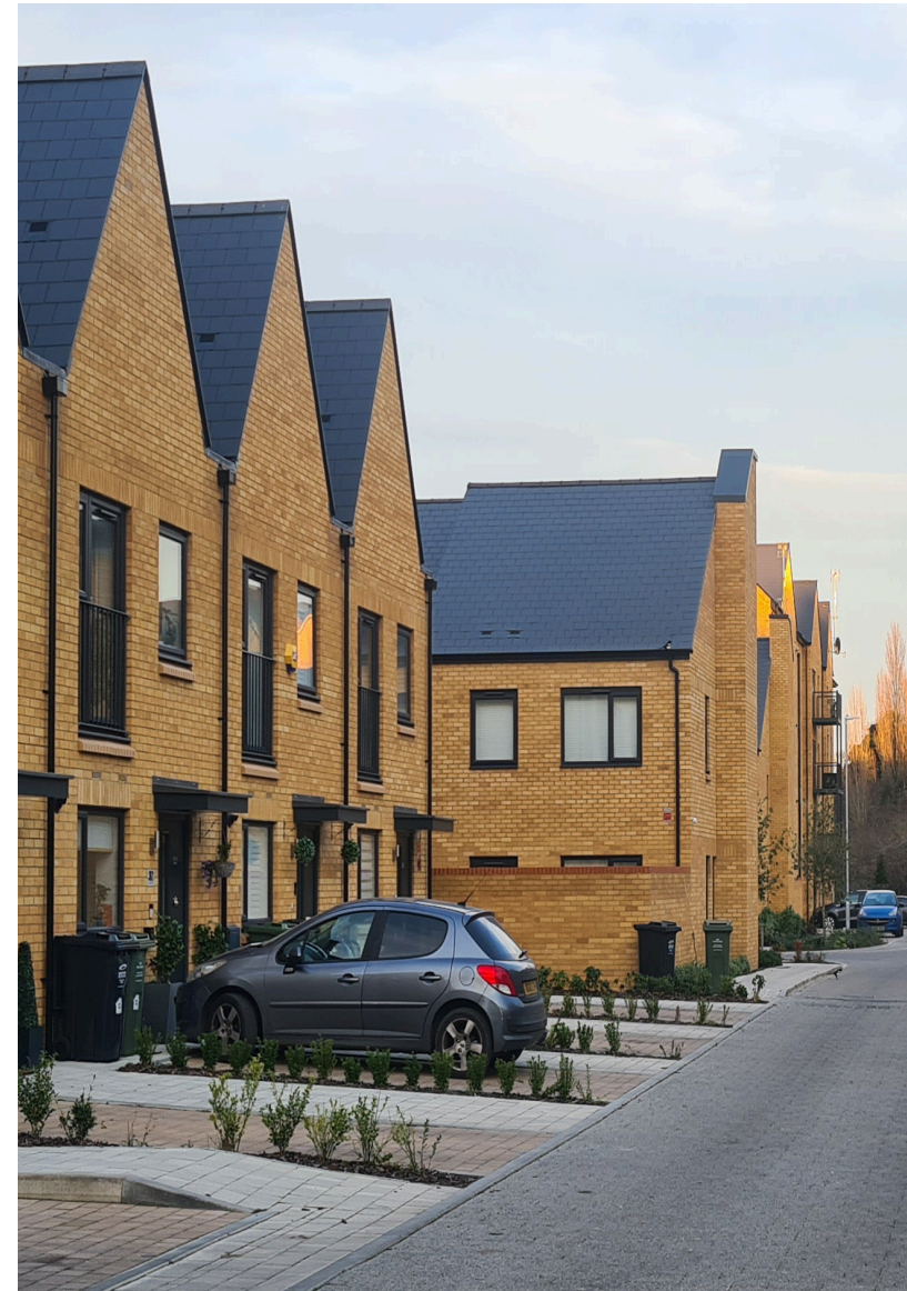
Ebbsfleet Cross

From time to time, it may be of benefit for specialist advice to be provided beyond the Design Forum membership. In such cases, a professional with the relevant expertise may be invited to attend a forum meeting, participating in the discussion with the status of an adviser to the forum.