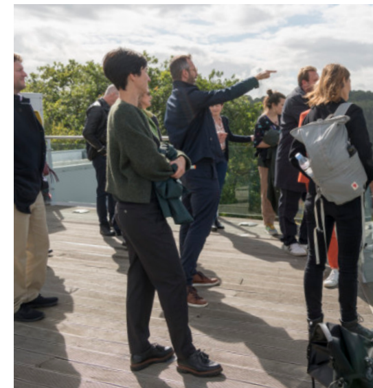
Ebbsfleet Design Forum Induction Meeting

The forum will be based on an open, constructive and discursive form of design review developed by EDC to ensure the service is valued by applicants. The forum will also play an important role in furthering EDC’s commitment to delivering characterful and distinctive places that are informed by the local area’s remarkable surroundings.