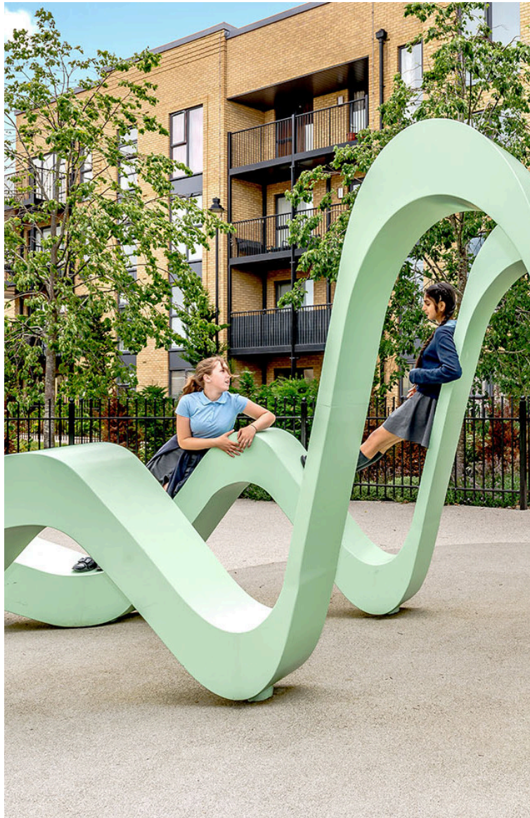
Born to be Wild © Ebbsfleet Development Corporation