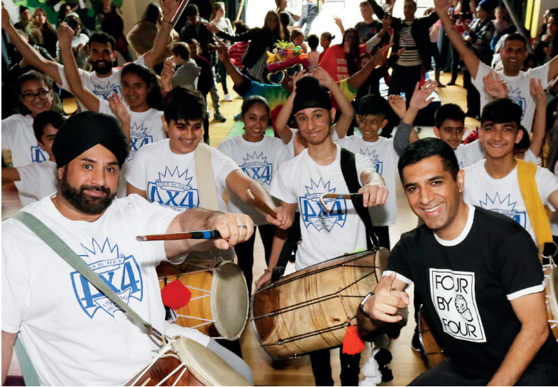
4x4 Bhangra Youth Club performing at 'The Gathering' March 2019.

Participation in culture will contribute to creatively engaged citizens. This will support happier, healthier and fulfilling lifestyles, commitment to local community life and foster a wider civic identity.