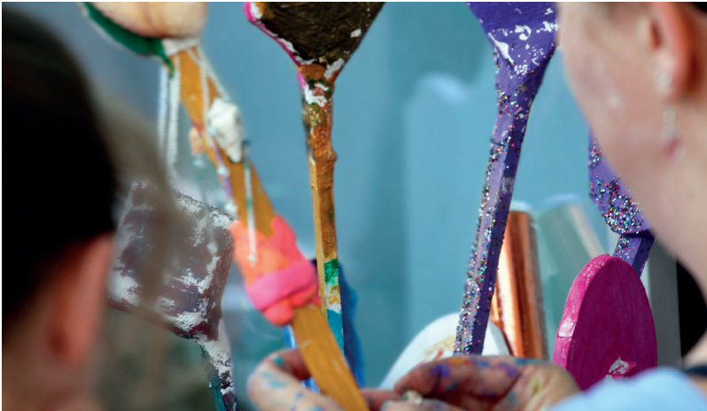
Artist Nicole Mollett delivering creative workshops with families at Castle Hill Summer Fete, August 2019.

We intend to use this power and its everyday value to the benefit of citizens in Ebbsfleet Garden City.